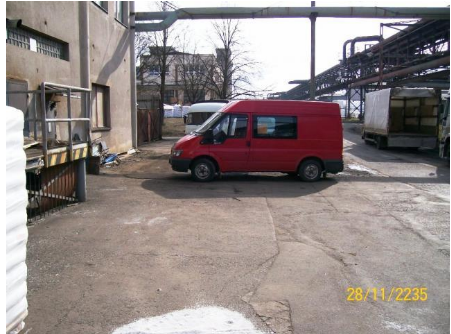
Handling area by the loading ramp