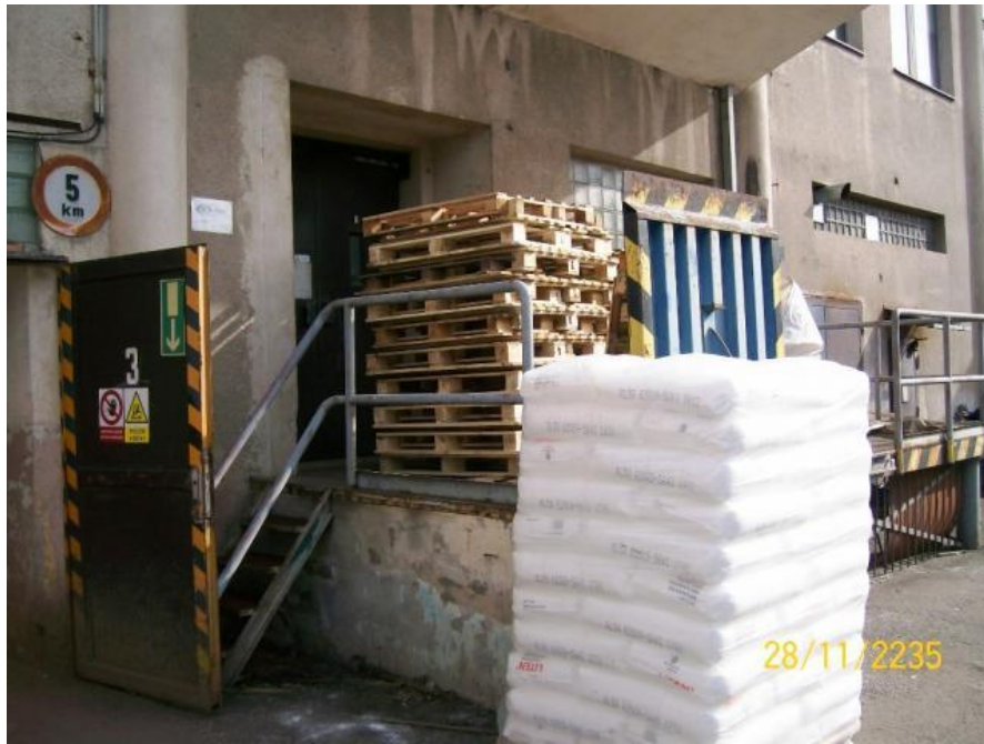
Loading ramp by the elevator