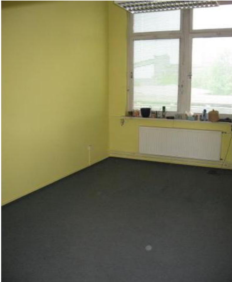
Office or cloakroom