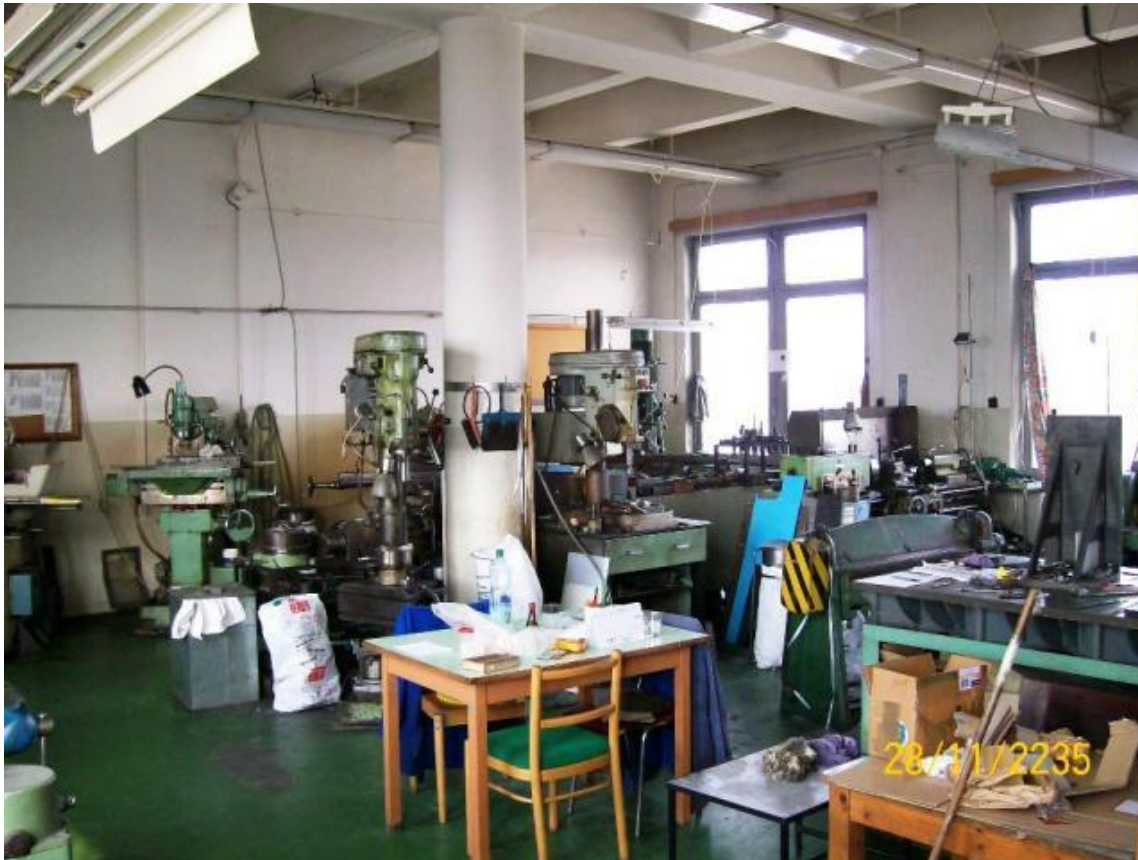
Production areas (former “Abalex” business premises)

The load bearing capacity of the floor is 400 kg/m 2 . The height of the former “Abalex” business premises, up to to the ceiling beam, is 3.90 m, 4.50 m to the ceiling panel.